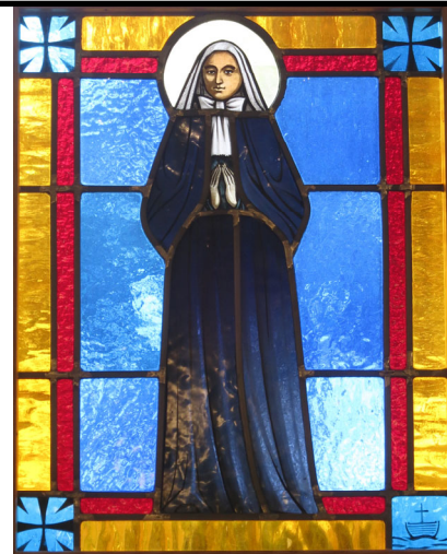
St. Frances Xavier Cabrini Feast Day: November 13th