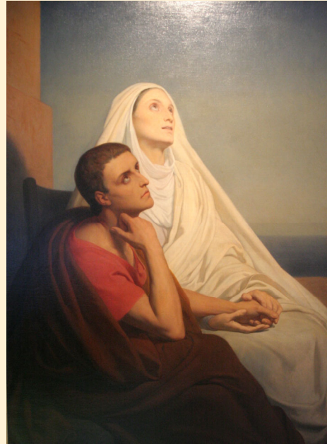
Saint Monica and Saint Augustine, Pray for Us